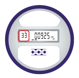
33 - Received kWh